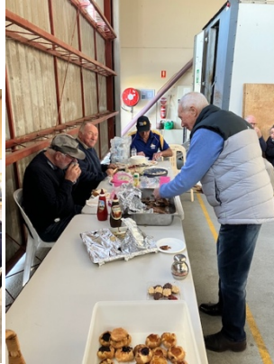
Working Bee at the Hangar: cleaning and BBQ