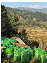
Distribution of tanks (donations from RAWCS project)