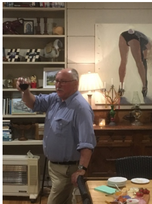
More Christmas cheer