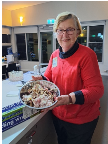
It's so good to be back at Western Care Lodge, offering a monthly meal to their guests