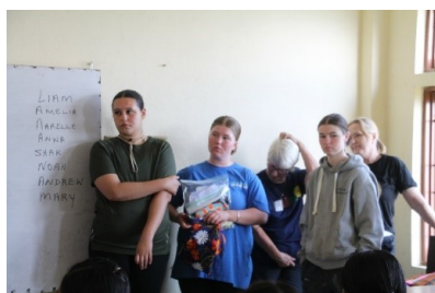
Schoolies distributing hygiene kits