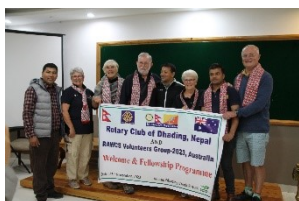
Rotary Club meeting

The team in 2024 will continue the work of the 2023 team.