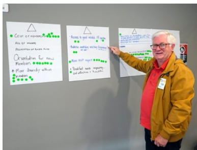
Workshopping away into the future of RCOD...