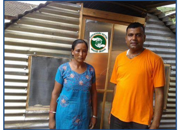
At right, Chhahari Nepal, a street-front NGO for people with a mental illness and a shelter for a woman made homeless by the quakes.