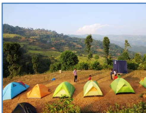
Photos show some of the team in Dhola, at the health post, and the tents at Maidi.